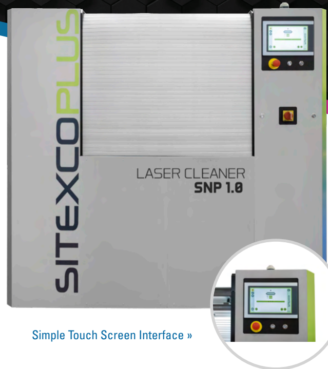
Simple Touch Screen Interface »