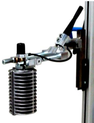
6" Electric Expand-O-Turn

The 12107-1 Series Electric Expand-O-Turn® is an electrically operated core expander for paper and film rolls with 3" and 6" cores and allows for manually rotating the roll. Rolls of varying dimensions, weights up to 300-lbs (depending on roll size), can be picked up from the vertical position at floor/pallet level and deposited at random heights in a horizontal position.