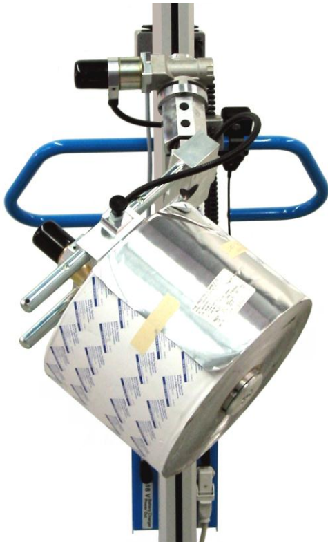
Electric Rotate Assembly