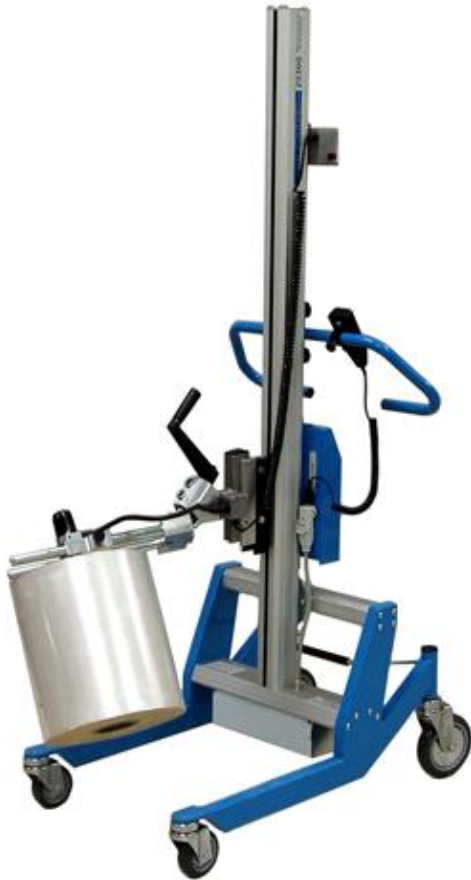
3" Electric Expand-O-Turn™