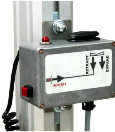
Expand-O-Turn™ Control Module